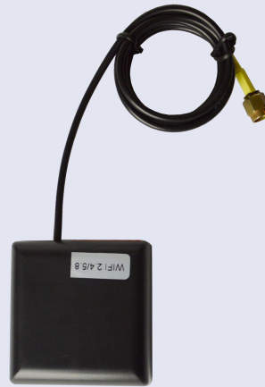
2.4/5.8G WIFI Antenna